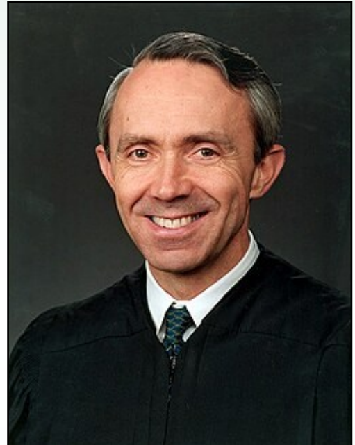
Associate Justice, 1990–2009 Appointed by President George H.W. Bush

Justice Souter was from Weare, New Hampshire, and he attended Concord High School. He served on the N.H. Supreme Court and as the state's attorney general before being appointed to the U.S. Supreme Court. He believed that change should come incrementally, or in small steps over time.